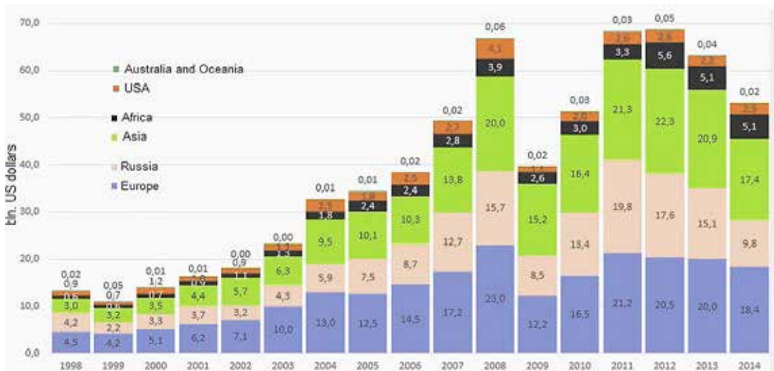
Fig. 2. Export of goods from Ukraine (1998-2014)

Source: State Statistics Committee, 2015