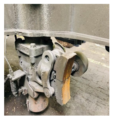
Fig. 1. Composite break shoe used in DE10000 Tülomsaş locomotives in Kardemir

Brake blocks, which are an important component for traffic safety, must meet certain requirements, such as a high and constant coefficient of friction, regardless of speed, specific pressure, temperature and environmental conditions. Low wear rate, lightness, low noise and corrosion resistance, and suitable thermodynamic properties are also desirable properties [4–6].