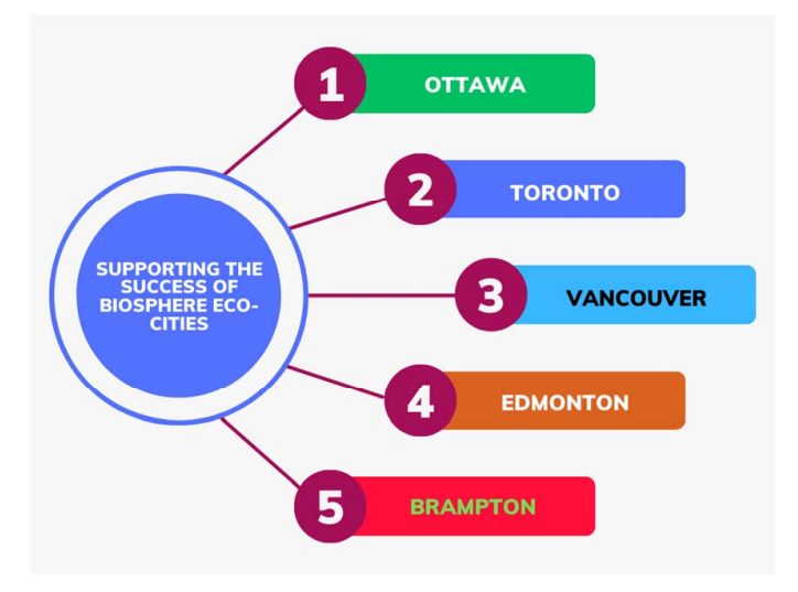
Figure 2. Structure biosphere Eco-Cities (BECs)