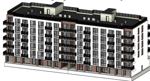
Figure 1. BIM model (building information model)

The analysis of materials during the design and creation of the building information model provides the optimization of the energy and carbon footprint. The results of creating such a model are reflected in the author's (master's) thesis. To build the investigated model of the residential complex in Bucha city, Autodesk Revit 2022 software was used (Fig. 1), and further analysis was conducted on the One Click LCA platform (Fig. 2). The use of this platform has permitted the assessment of the characteristics of the materials used in construction and their impact on the environment, which facilitated the selection of safer materials without compromising the mechanical properties of the object.